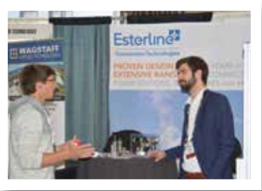
EXHIBIT HALL LAYOUT